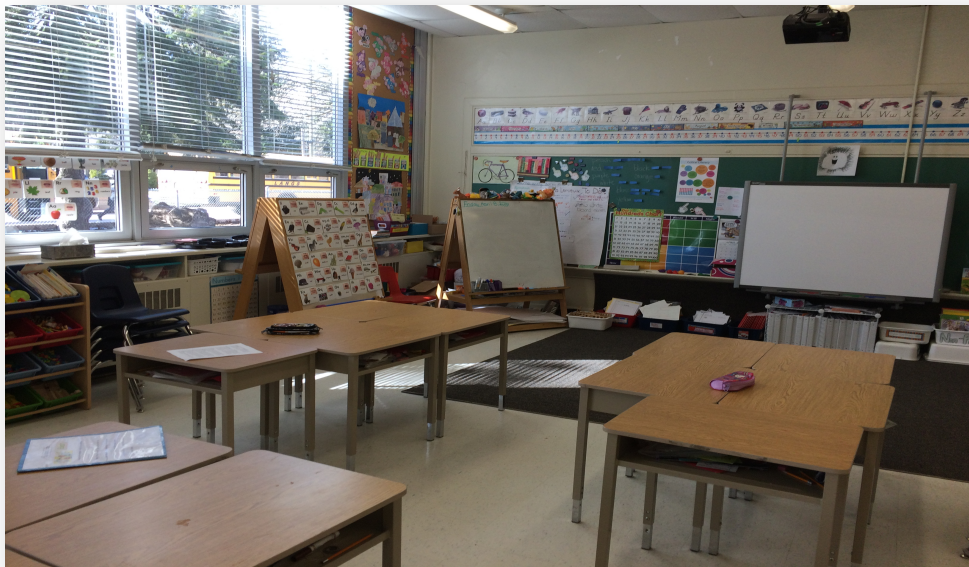
Figure 3. A picture image of the SMART Board and carpet area in Grade One classroom

displayed children's desks. The children each had a desk of their own. Jennifer usually had four to five desks pushed around to facilitate children's discussion and teamwork, but the seats of the children rotated regularly in order to support collaboration between different peers. In front of the classroom, there was a large carpet where children could sit comfortably during whole group learning. Jennifer used a tabletop whiteboard and a SMART board (see Figure 3) to provide visual support for instruction and scaffold for all lessons. The layout and the arrangement of the classroom were so flexible that all students could comfortably engage in their learning, and interact with their teacher and peers in either groups or individuals.