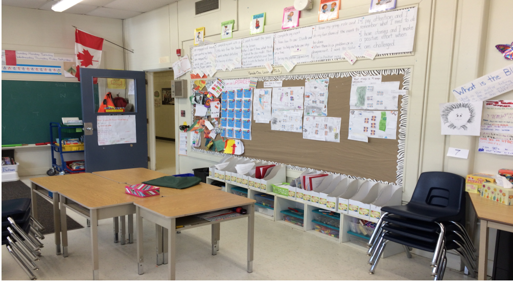
Figure 1. A picture image of the students' mailbox and desk in Grade One classroom