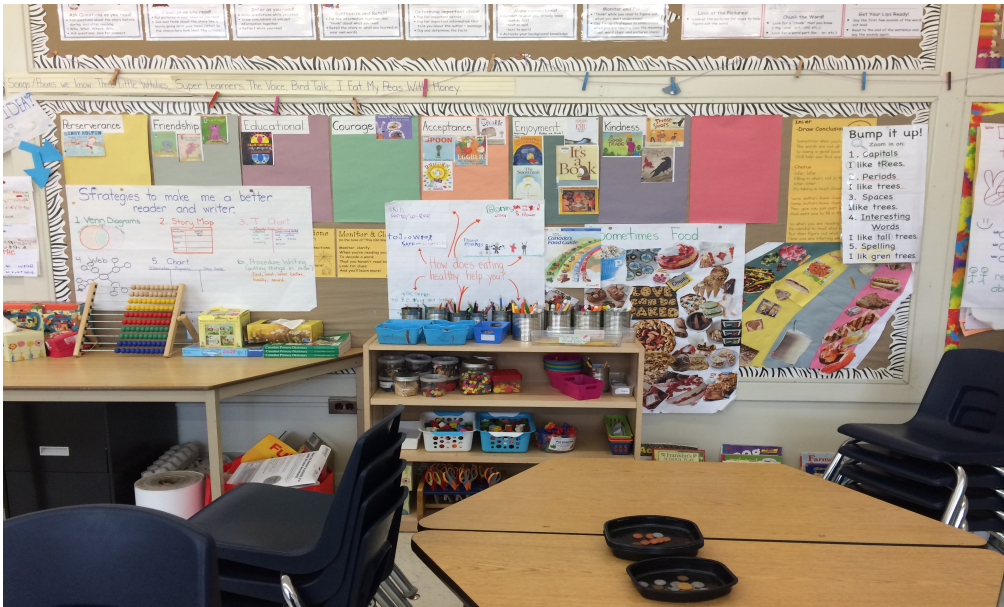
Figure 2. A picture image of the display center in Grade One classroom

Directly behind her desk, against the wall, was a storage closet that hosted different teaching materials, books, and curricular documents. During our interview sessions, Jennifer indicated that she loved reading and learning, which provided her timely knowledge and inspirations to design meaningful activities, to modify instruction, and to accommodate children's diverse needs. In the middle of the classroom, there were neatly